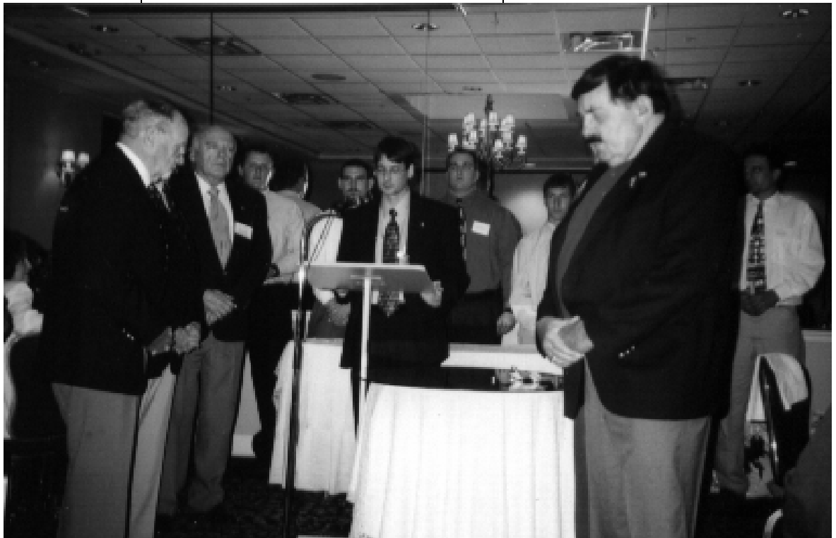
Brothers receive their Legion & Palladian pins

"the laughter bug", gave a humorous presentation on the positive power of laughter.